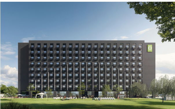
H101-Madrid Exterior Facade v2 02