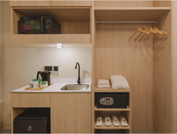
Hotel101 Showroom (Walkway)